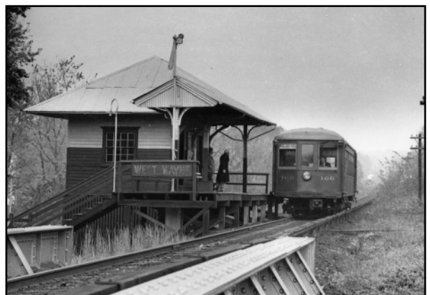
A P&W trolley stops to pick up passengers at West Wayne Station. One of the new 2011 signs has been erected on the site of the old platform.

Radnor Conservancy P.O. Box 48 Wayne, PA 19087