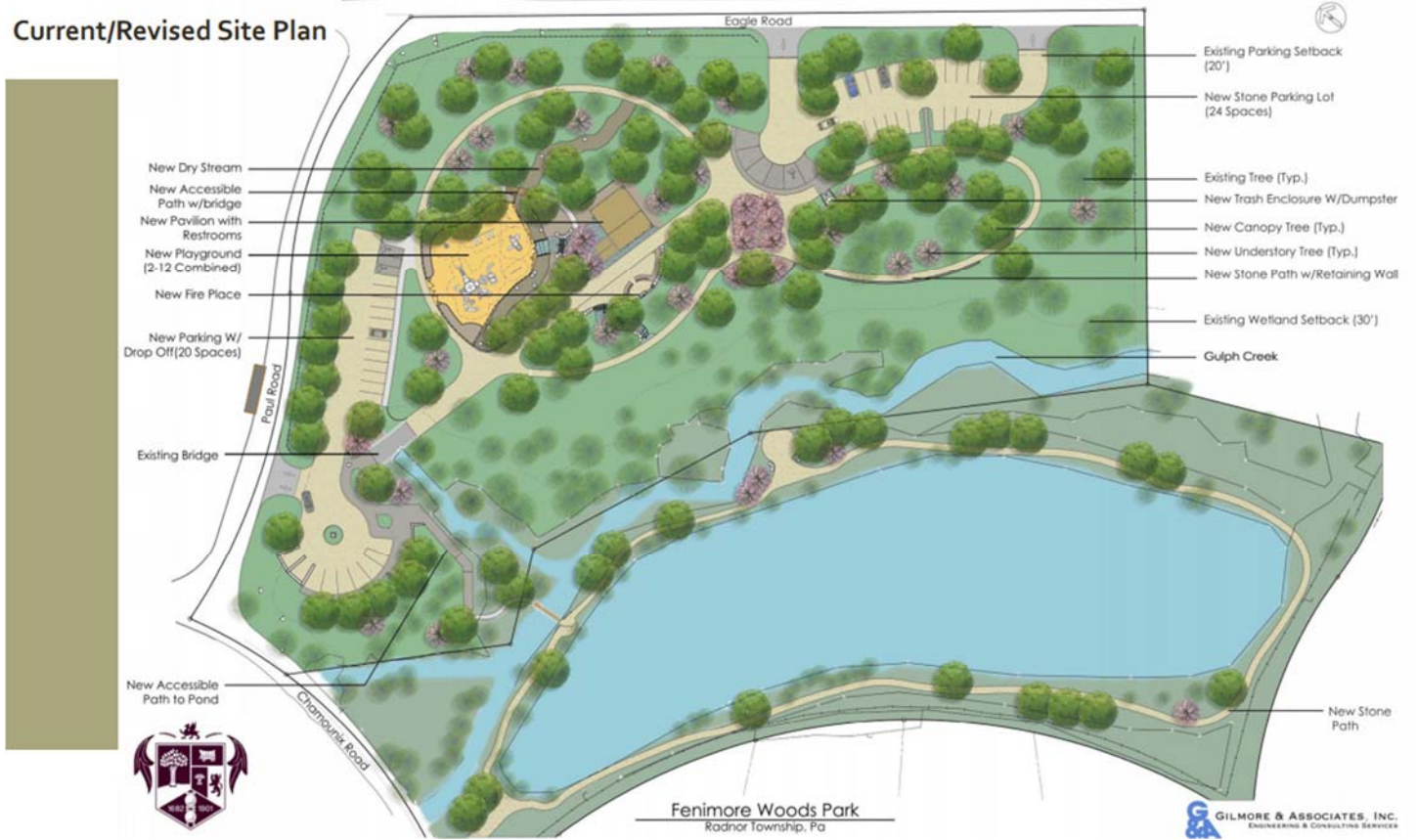
Tree images are selected specifically to indicate 10-12 year-old growth, consistent with Landscape Architect standards