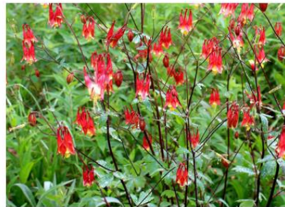
Wild Columbine Aquilegia canadensis