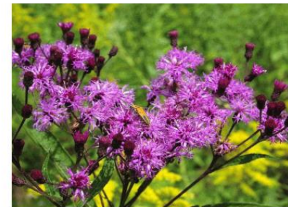
New York Ironweed Vernonia noveboracensis

Comment: Showy flowers, attracts butterflies