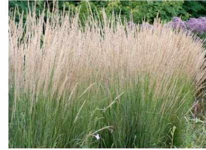
Karl Foerster Feather Reed Grass Calamagrostis acutiflora 'Karl Foerster'

Comment: Excellent erosion control species