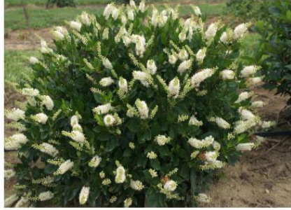
Ruby Spice' Summersweet Ruby Clethra alnifolia