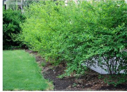
Spicebush Lindera benzoin