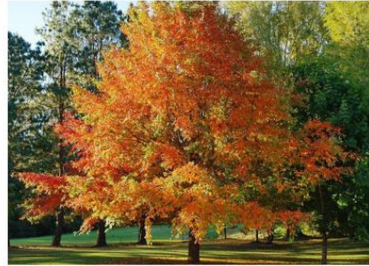
Blackgum Nyssa sylvatica