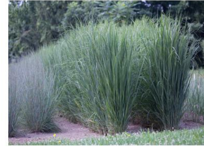
Northwind' Switchgrass Panicum virgatum 'Northwind'

Comment: Showy flowers, attracts hummingbirds and butterflies