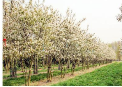
Common Serviceberry Amelanchier canadensis