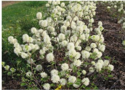
Suzanne Fothergilla Fothergilla gardenii 'Suzanne'