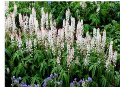
Candy Striper Foamflower Tiarella cordifolia 'Candy Striper'

Comment: Showy flowers, attracts butterflies