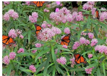
Swamp Milkweed Asclepias incarnata

Comment: Showy flowers, attracts butterflies