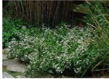
Eastern Star' Woodland Aster Aster divaricatus 'Eastern Star'