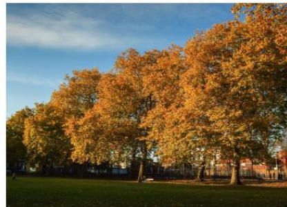
London Planetree Platanus acerfolia

Comment: Attracts wildlife, glossy dark green leaves