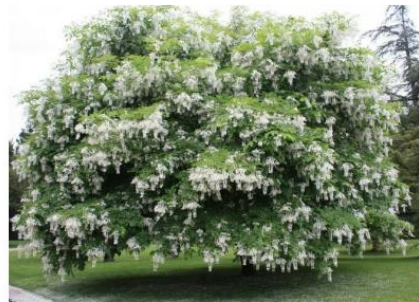
Perkins Pink' Yellowwood Cladrastis kentukea 'Perkins Pink'

Comment: Tolerant of air pollution, drought, deer