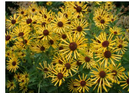
Henry Eilers' Sweet Coneflower Rudbeckia subtomentosa 'Henry Eilers'

Comment: Tolerant to drought, erosion, air pollution