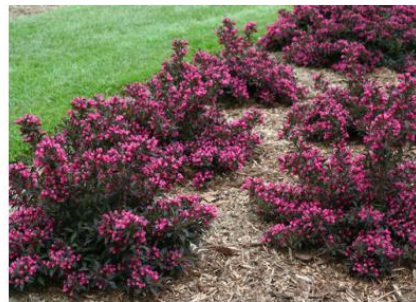
Fine Wine Weigela Weigela florida 'Fine Wine'

Comment: Attracts birds and butterflies, showy flowers