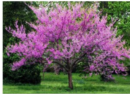
Eastern Redbud Cercis canadensis