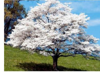
Flowering Dogwood Cornus florida

Comment: Showy flowering from April to May