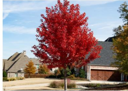
October Glory' Red Maple Acer rubrum 'October Glory'