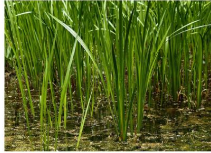
Sweetflag Acorus americanus