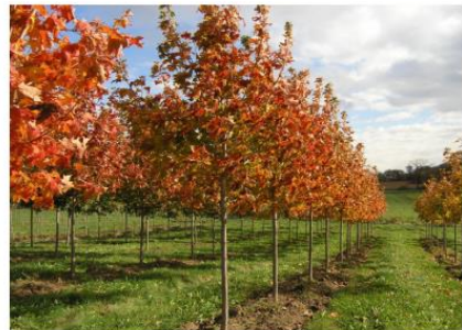
Fall Fiesta' Sugar Maple Acer saccharum 'Fall Fiesta'