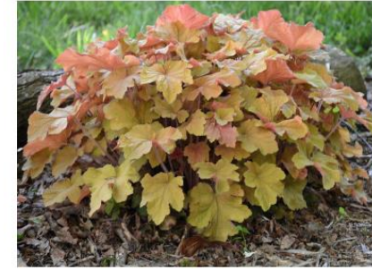
Caramel Alum Root Heuchera villosa x 'Caramel'