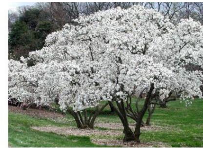
Sweetbay Magnolia Magnolia virginiana

Comment: Attracts butterflies, showy flowers