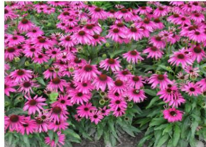
Purple Emperor' Coneflower Echinacea purpurea 'Purple Emperor'

Comment: Showy flowers, attracts butterflies