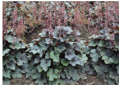
Stainless Steel' Coral Bells Heuchera x 'Stainless Steel'

Comment: Showy flowers, attracts birds and butterflies