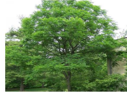
Kentucky Coffee Tree Gymnocladus dioica