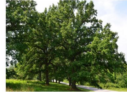
Swamp White Oak Quercus bicolor

Comment: Slow growing, fruits attract birds and wildlife