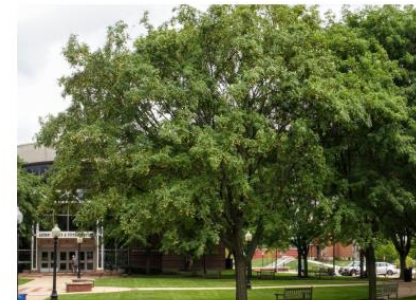
Honeylocust Gleditsia triacanthos

Comment: Showy red fall color, rapid growth rate