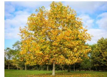
Tulip Poplar Liriodendron tulipifera