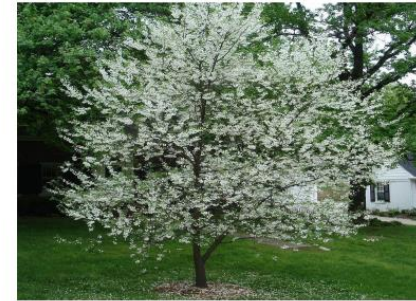
Carolina Silverbell Halesia carolina