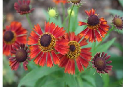
Siesta' Sneezeweed Helenium autumnale Mariachi 'Siesta'