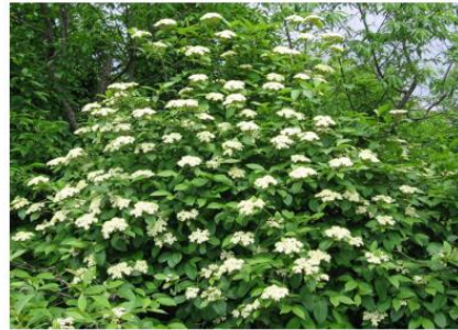
Maple Leaf Viburnum Viburnum acerfolium