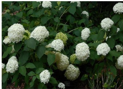
Ryan Gainey' Smooth Hydrangea Hydrangea arborescens 'Ryan Gainey'