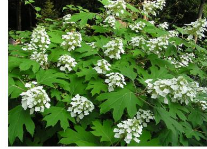
Pee Wee Oakleaf Hydrangea Hydrangea quercifolia 'Pee Wee'