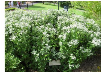
Mountain Mint Pycnanthemum muticum*

Comment: Showy flowers, attracts hummingbirds and butterflies