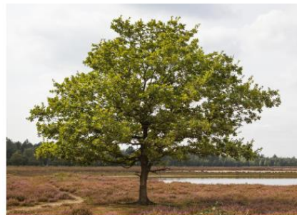
Sawtooth Oak Quercus acutissima

Comment: Tolerant of urban conditions, attracts butterflies