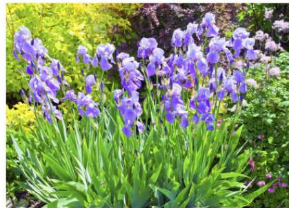
Blue Flag Iris Iris versicolor