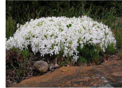
Snowflake' Creeping Phlox Phlox subulata 'Snowflake'