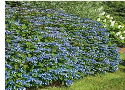
Sawtooth Hydrangea 'Blue Bird' Hydrangea serrata 'Blue Bird'