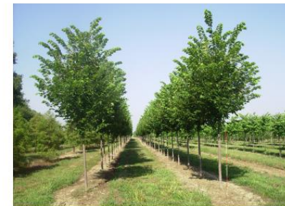
Princeton' Elm Ulmus americana 'Princeton'