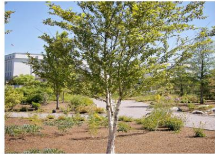
Duraheat' River Birch Betula nigra 'Duraheat'

Comment: Attracts birds and butterflies, showy flowers