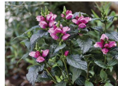
Tiny Tortuga' Turtlehead Chelone obliqua 'Tiny tortuga'

Comment: Showy, fragrant flowers, attracts butterflies