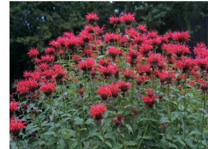
Bee Balm Monarda didyma