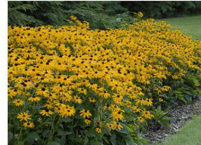
Black Eyed Susan Rudbeckia fulgida

Comment: Showy flowers, attracts butterflies