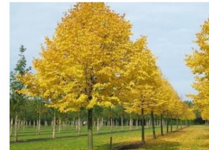
Little Leaf Linden Tilia cordata