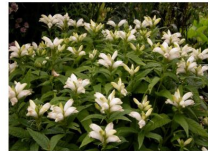
Turtlehead Chelone glabra

Comment: Showy flowers, attracts hummingbirds