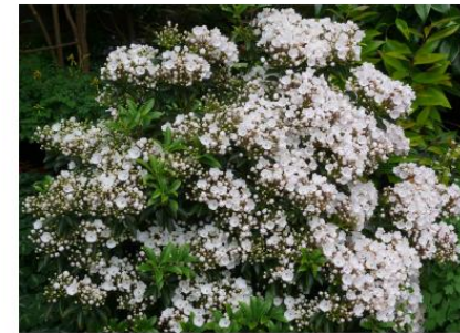
Elf' Mountain Laurel Kalmia latifolia 'Elf'