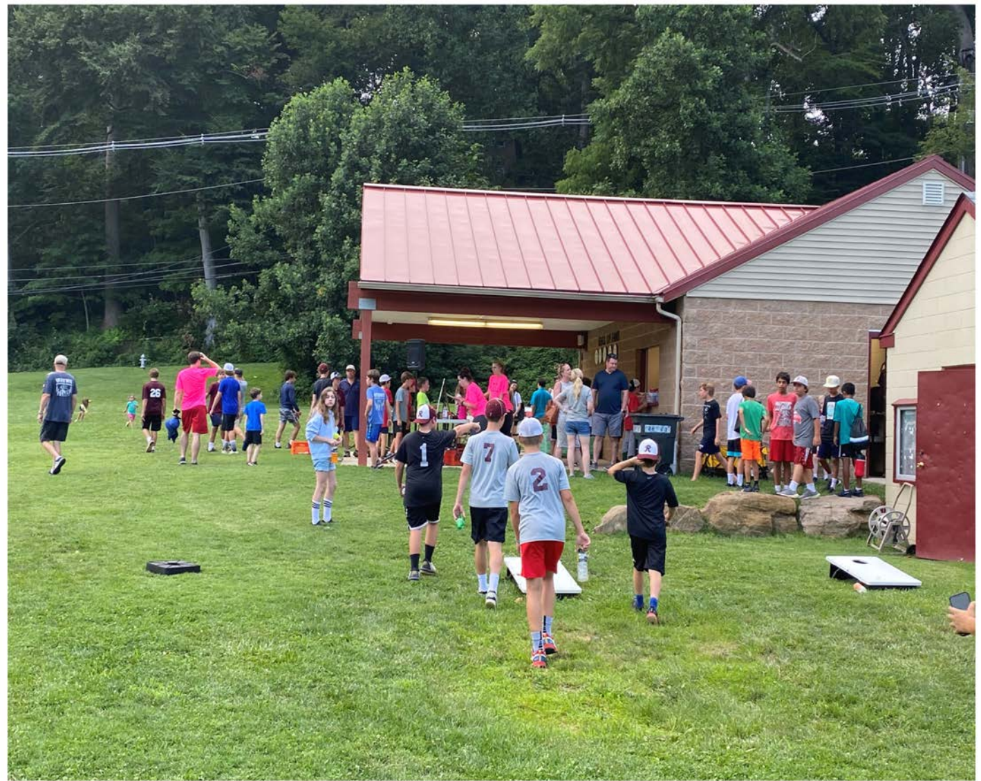
Activities such as corn hole and Jenga were played while waiting for the next games to start.