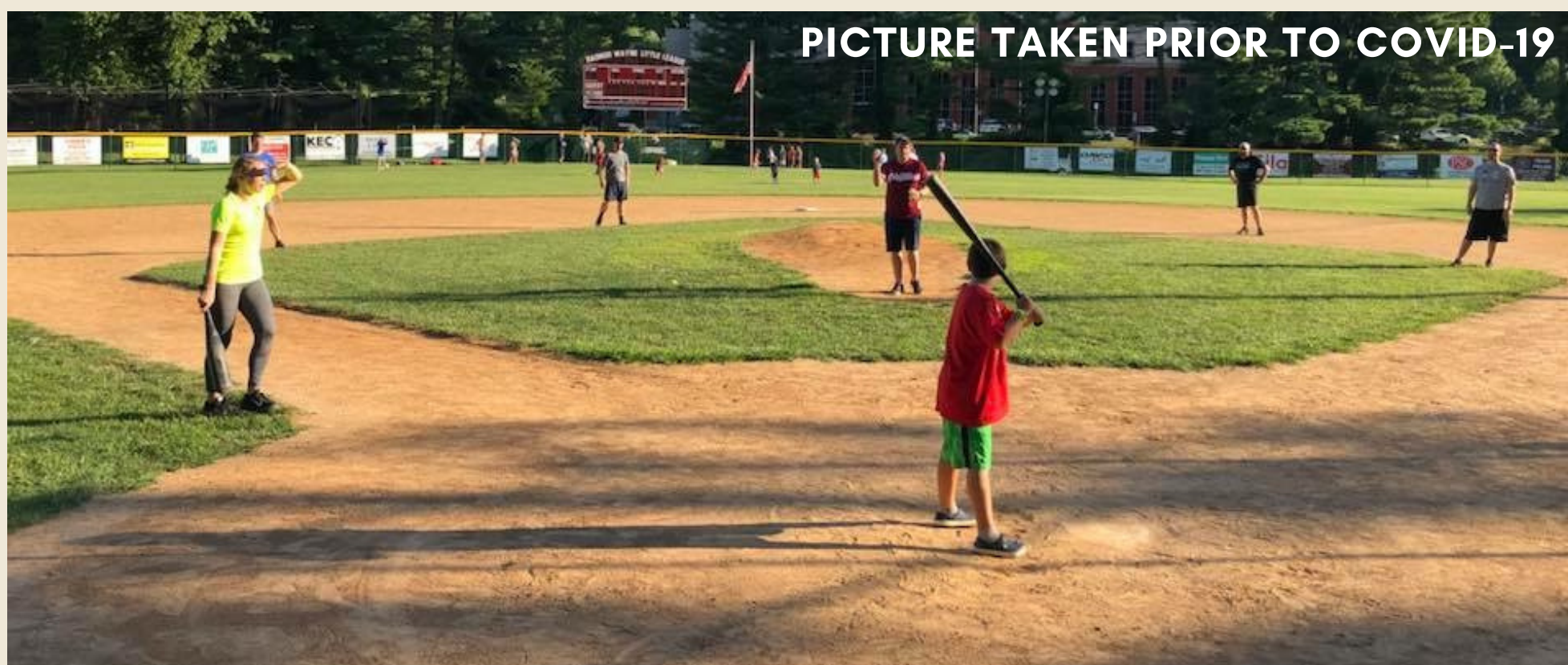
PICTURE TAKEN PRIOR TO COVID-19

COVID-19 Health and Safety Protocols will be followed. More information will be provided to registrants before the event. In the event of unforeseen situations such as those imposed by inclement weather or health and safety issues, cancellations may occur.