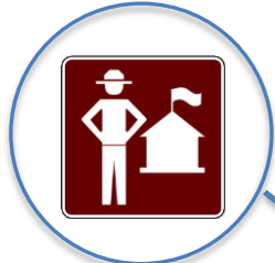
Picnic Grove - Registration Area