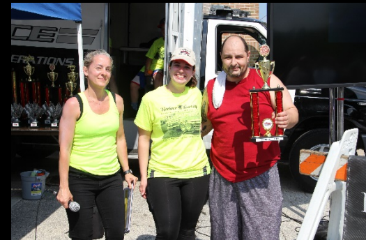
FIRST RUNNER UP PIZZA New Wayne Pizza