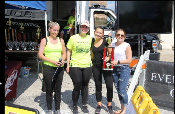
BEST PIZZA WINNER From the Boot