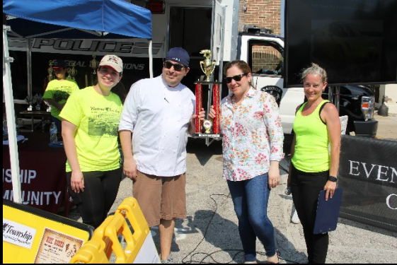
BEST PULLED PORK WINNER Cornerstone