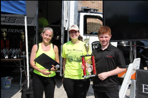
FIRST RUNNER UP PULLED PORK Matador