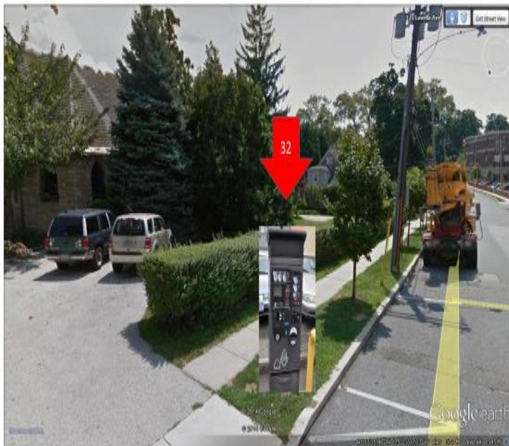
Louella Ave. (St. Mary's Driveway)