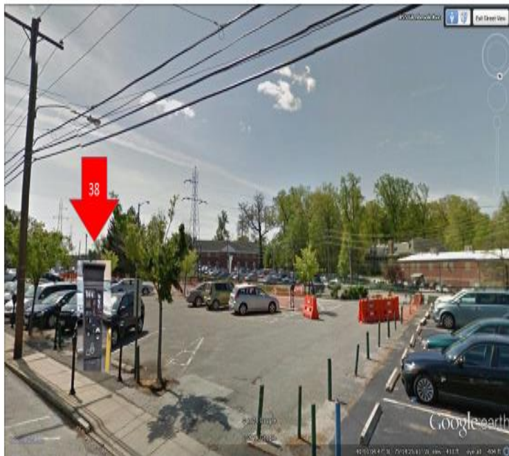
Glenbrook Lot (Street)

BELLEVUE LOT, TWO KIOSKS ARE LOCATED IN THE BELLEVUE LOT AT EACH ENTRANCE